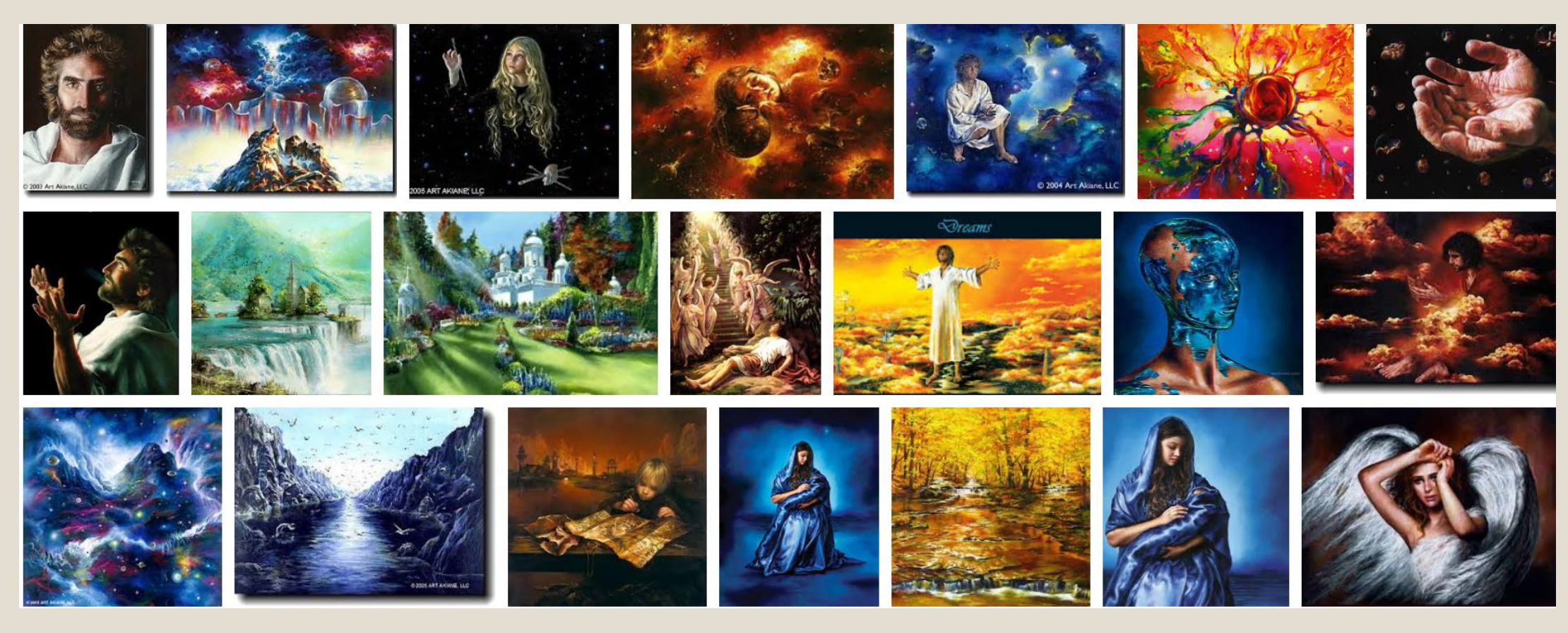
More paintings and poetry: https://art-soulworks.com/pages/akiane-art-gallery